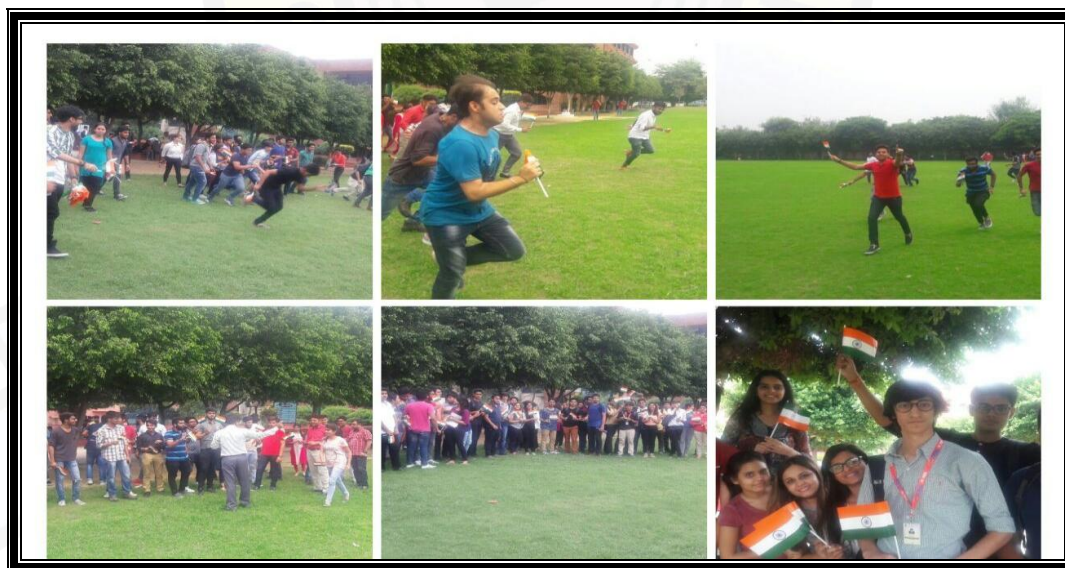
Students taking part in Run for Freedom during AZADI' 70