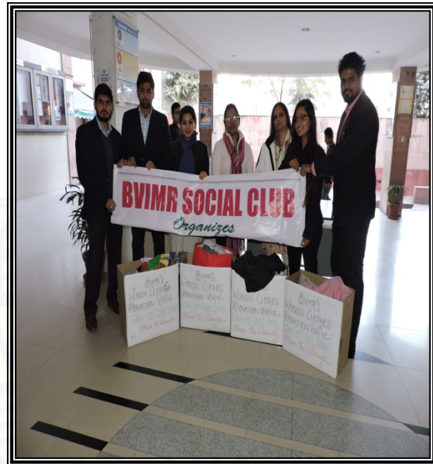
Students of Social & Eco Club conducting Woollen Clothes Donation Camp from 13 th -26 th