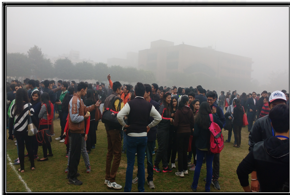
Students gathering at Annual Sports Meet 2016