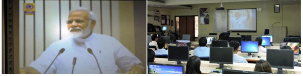
Webcast through AICTE portal address by P.M of India on "Sankalp to Siddhi"

'A' GRADE UNIVERSITY STATUS AWARDED BY MHRD, GOVT. OF INDIA RE-ACCREDITED WITH 'A+' GRADE BY NAAC