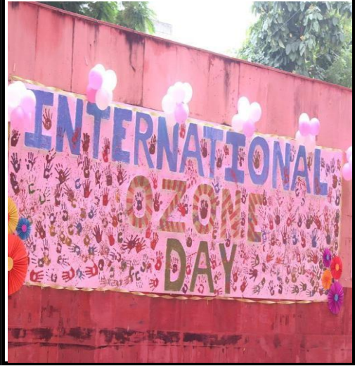
Faculty and students participating in International Ozone Day

The creativity of the students was clearly reflected by the way the amphitheatre was decorated, using balloons, flowers and other material. It looked splendid and was a treat to the eyes of the spectators.