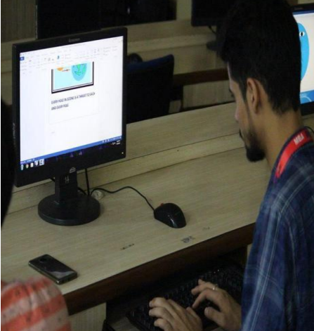
Students showing their creative skill in making green greetings card, Digi-Card