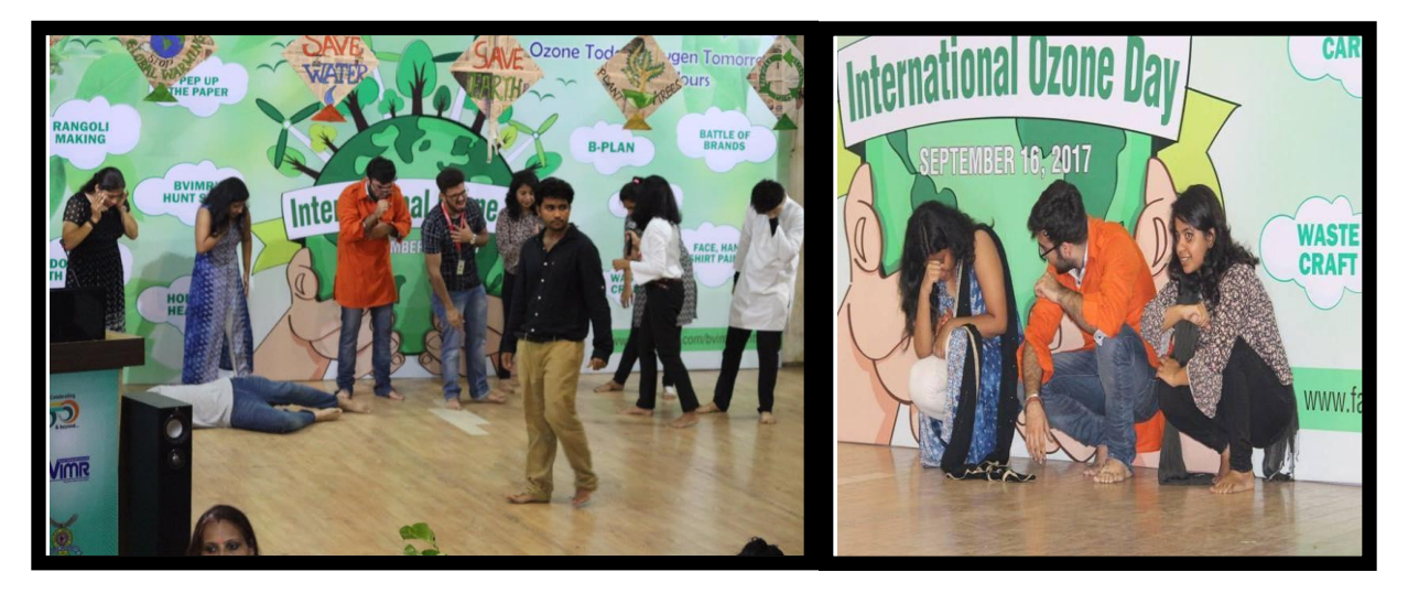
Students exhibiting their dramatic skills during International Ozone Day

'A' GRADE UNIVERSITY STATUS AWARDED BY MHRD, GOVT. OF INDIA RE-ACCREDITED WITH 'A+' GRADE BY NAAC