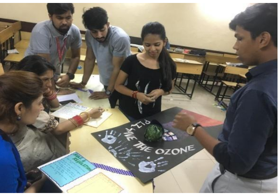
Students participating in Rang Manch Rangoli Pep Up the Paper during International Ozone Day