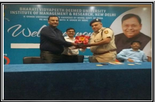
Students in action during the orientation