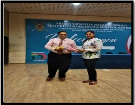
Various speakers being welcomed during the orientation program

A two-day reorientation programme was organized by the institute from 10 <sup>th</sup> July 2017 to 11 <sup>th</sup> July 2017, to make the final year students aware of the new curriculum and rules of the institute. The theme of the orientation programme was "Campus to Corporate" .