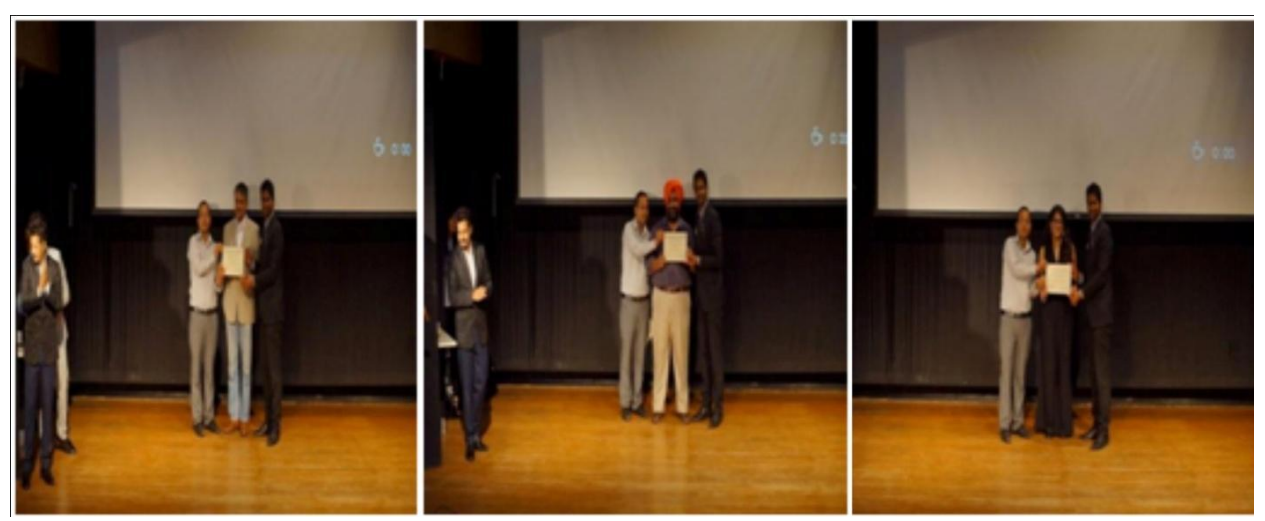
Prize distribution ceremony for the best speaker, best evaluator & best table topic speaker (left to right).

The most awaited part of the event – prizes were distributed in the form of certificates to the best speaker, evaluator and table topic speaker, based on the audience's votes. It was followed by a standing ovation and cheering by the audience.