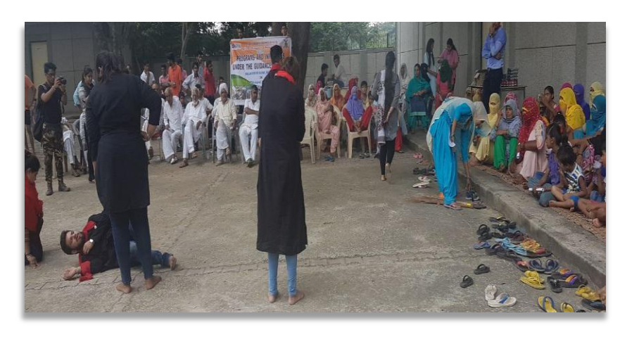
Village residents eagerly listening and learning

team mates and several residents were our audience for the day. Students along with the respective faculty members got an opportunity to interact with people and create a bond of mutual respect.