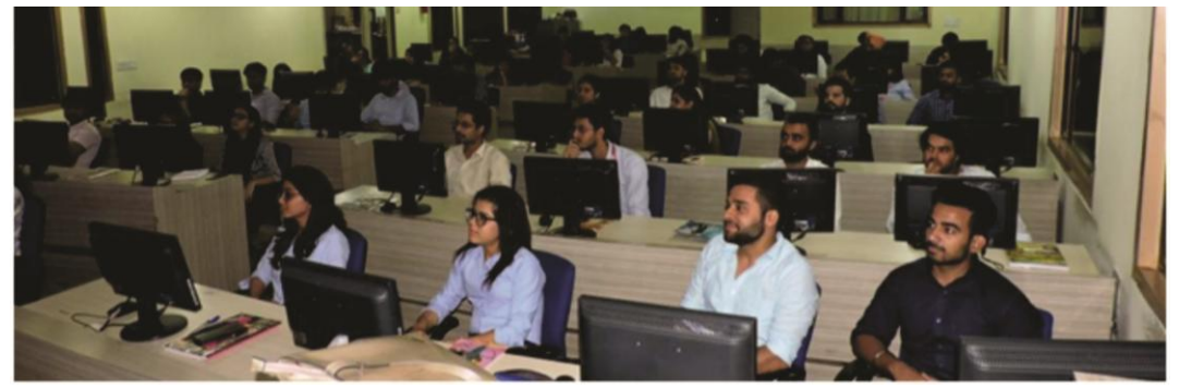
GLIMPSES OF THE CLEAN DRIVE CAMPAIGN