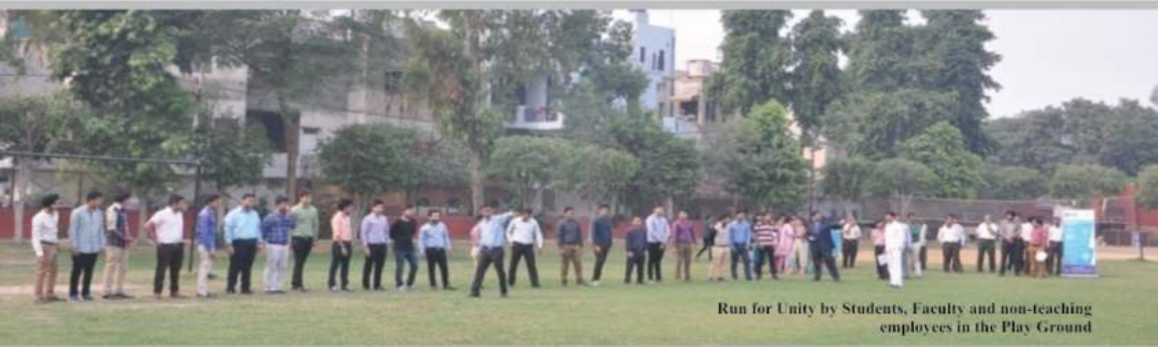
Run for Unity by Students, Faculty and non-teaching employees in the Play Ground