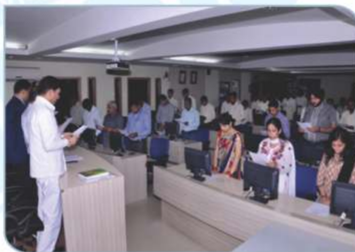
BVIMR staff members taking pledge during Rashtriya Ekta Diwas

The Rashtriya Ekta Diwas was celebrated with full sprit and enthusiasm at the institute on 31st October, 2014. This event was organized as a mark of honour to the contribution of Shri Sardar Vallabbhai Patel to India's unity, safety and security. All faculty members, non-teaching employees and students actively participated in Rashtriya Ekta Diwas Celebration.