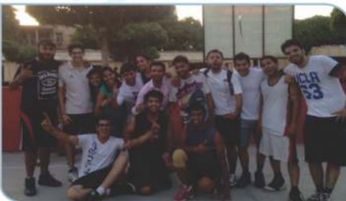
BBA - III year students after winning Inter - Class Basketball Tournament Celebrate