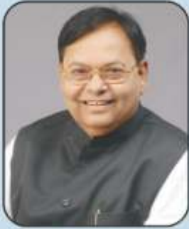
Hon'ble Dr. Patangrao Kadam Founder, Bharati Vidyapeeth Chancellor, Bharati Vidyapeeth University, Pune