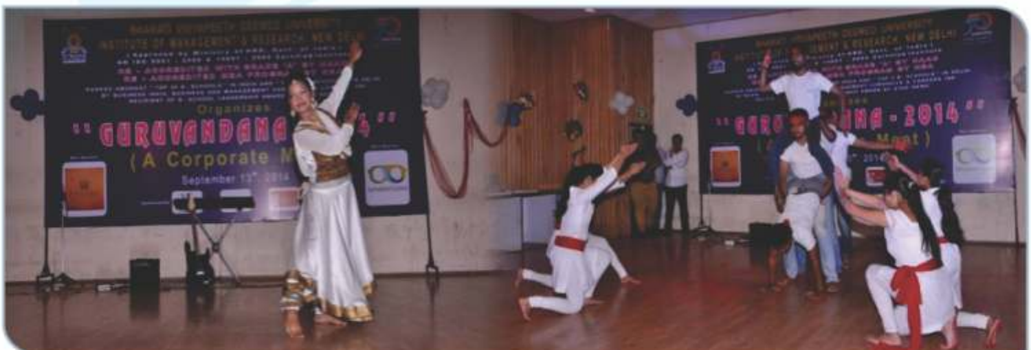
MBA and BBA students performing during the event