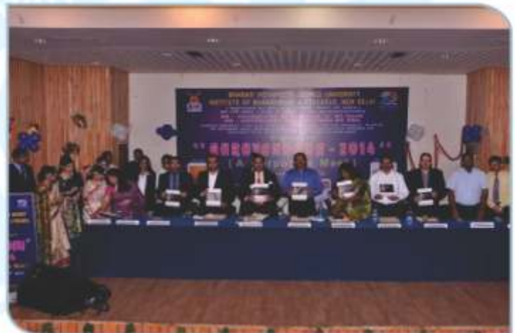
CRC Team & Chief Guests launching Placement Brochure 2014 during Guruvandana at BVIMR, New Delhi

This year also the institute celebrated Guruvandana on 13th September 2014. The program was graced with