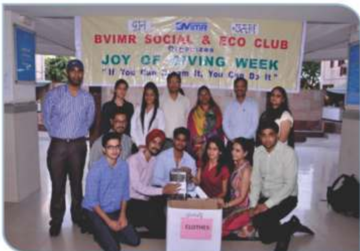
The social club members (faculty and students) of BVIMR, New Delhi

The social club of the Institute took the initiative of celebrating Daan Utsav in the last week of September i.e. from September 22nd to 27th. Donation boxes were set up in the institute for the collection of: Cash, Clothes, Books and stationary and other basic amenities. The students and members of faculty contributed for the same with zeal & zest.