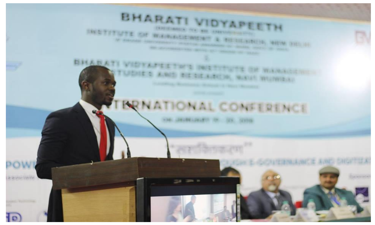
Mr. Presidoe Okugini-Representative , African Association of Students in India addressing audience emphasizing need of digitization