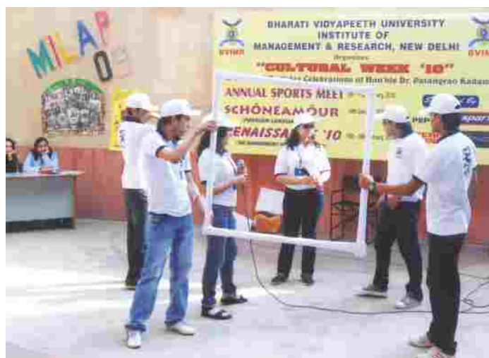
(Students showing their creativity in SchoneAmour