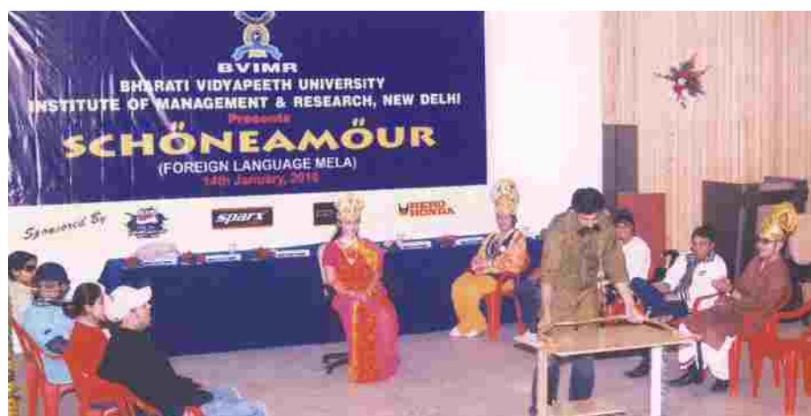
(Role play on "SITA SWAYAMWAR" performed by students during SHONEAMOUR)