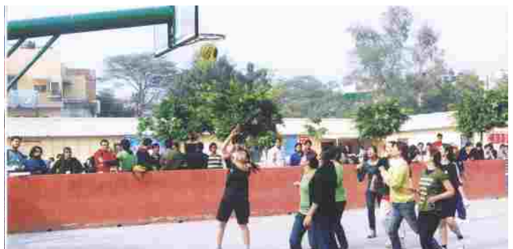
(Girl's Volleyball Team Match)