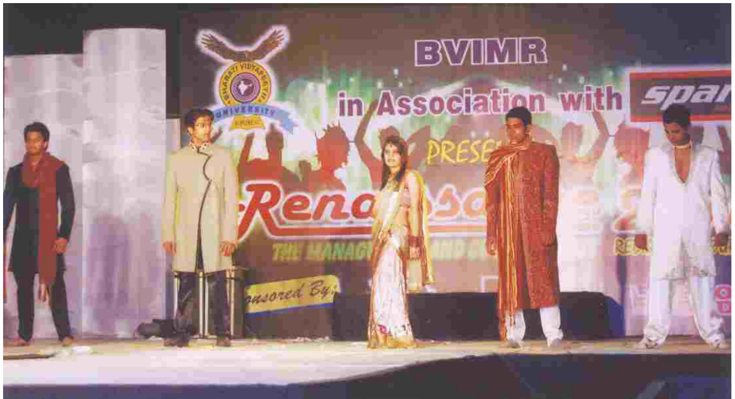
Mr. & Miss Renaissance Contest