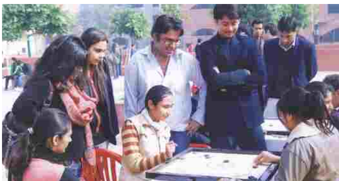
(Students playing carrom)