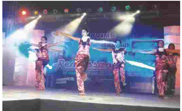
Star Attraction : Fashion Show