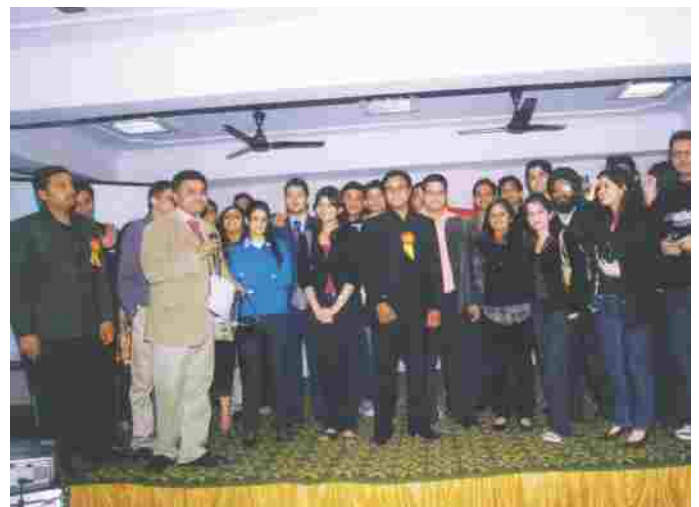
( MILAP Organizing team)