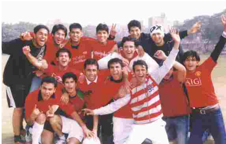
(The Winning cricket team: BBA IV Semester)