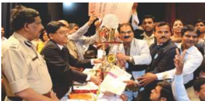
IMED secured First Prize of Rs. 2, 00,000 in State Level Road Safety Awareness Campaign

Special add-on course is to develop them as finished products in terms of managerial skills and personal excellence.