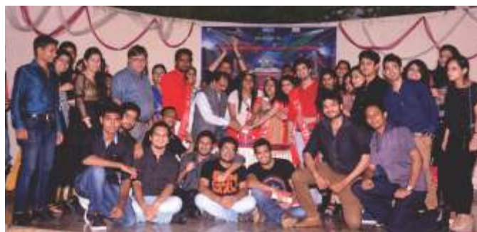
IMED secured First Prize of Rs. 2, 00,000 in State Level Road Safety Awareness Campaign