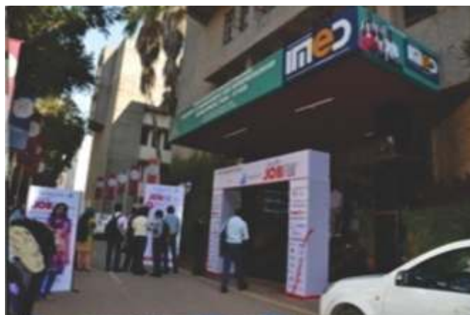
Job Fair at IMED

Makes holistic efforts to develop proper personality traits among the students that are required for their future career as business managers.