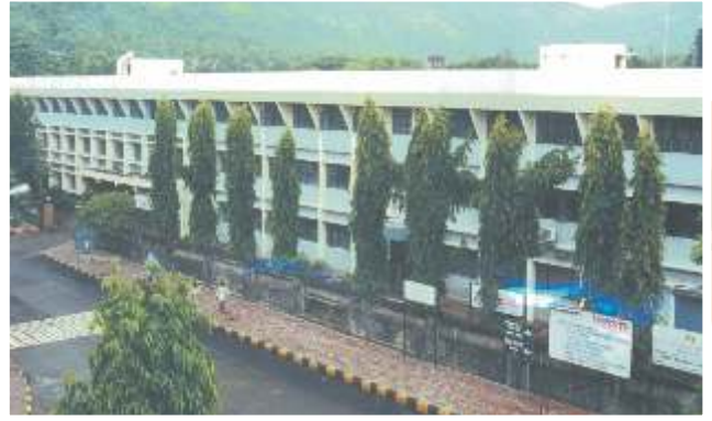
Bharati Vidyapeeth Institute of Management and Entrepreneurship Development, Navi Mumbai