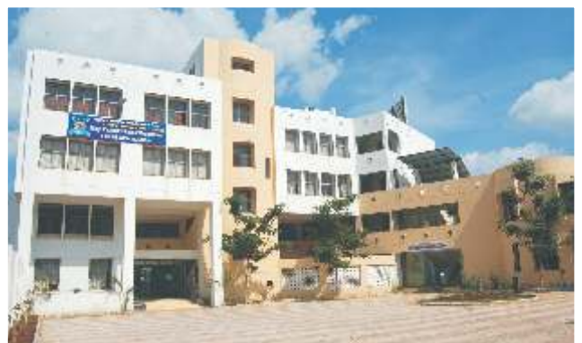
Abhijit Kadam Institute of Management and Social Science, Solapur