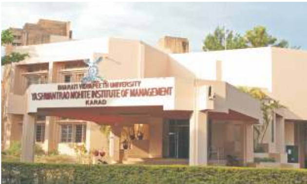
Yashwantrao Mohite Institute of Management, Karad