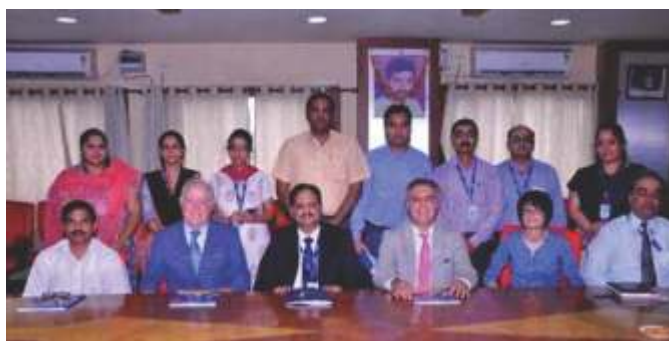
Spanish Delegates from CESTE International Business School, Zaragoza, Spain