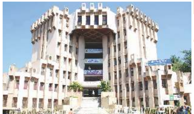
Institute of Management and Rural Development Administration, Sangli