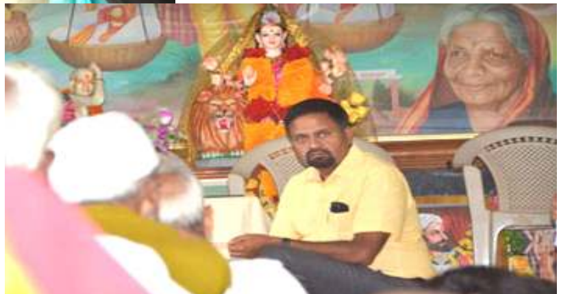
Reverse adoption activity at old age home