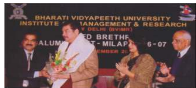
Hon'ble Shatrughan Sinha during an event.