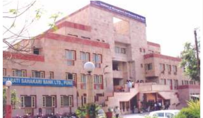
Institute of Management and Research, New Delhi