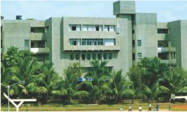
Institute of Management and Entrepreneurship Development, Pune