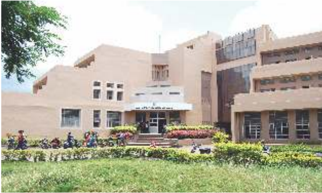
Institute of Management, Kolhapur