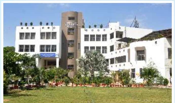
Abhijit Kadam Institute of Management and Social Science, Solapur