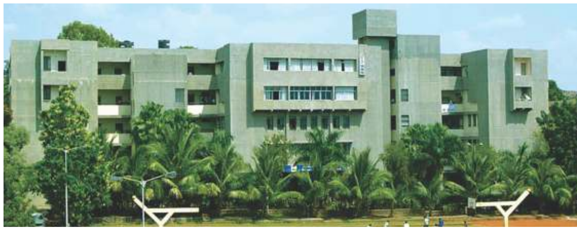
Institute of Management and Entrepreneurship Development, Pune