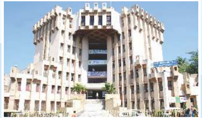
Institute of Management and Rural Development Administration, Sangli