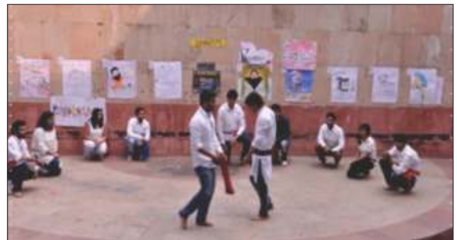
Students performing street play in Renaissance