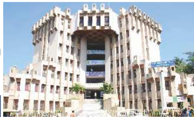
Institute of Management and Rural Development Administration, Sangli