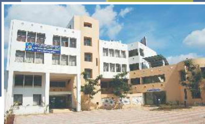
Abhijit Kadam Institute of Management and Social Science, Solapur