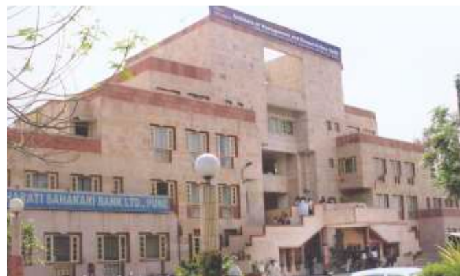
Institute of Management and Research, New Delhi

Bharati Vidyapeeth Bhavan, Lal Bahadur Shastri Marg, Pune - 411 030. Phone No. : 020-24325510, 24325509, 24407131/132/133 Fax No. : 020-24329675 Website : www.bvuniversity.edu.in www.bharatividyaapeethuniversity.net