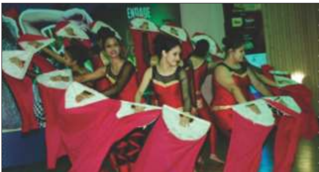
Students in action at the Annual Cultural Festival