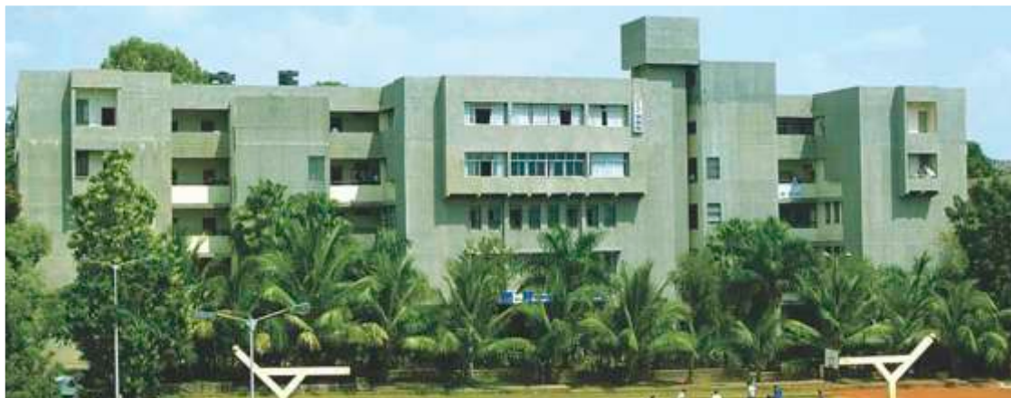
Institute of Management and Entrepreneurship Development, Pune