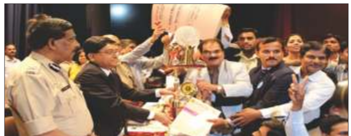
IMED secured First Prize of Rs. 2, 00,000 in State Level Road Safety Awareness Campaign