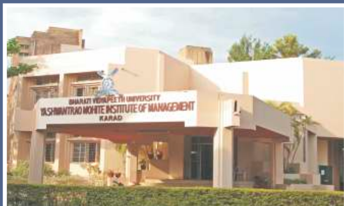
Yashwantrao Mohite Institute of Management, Karad