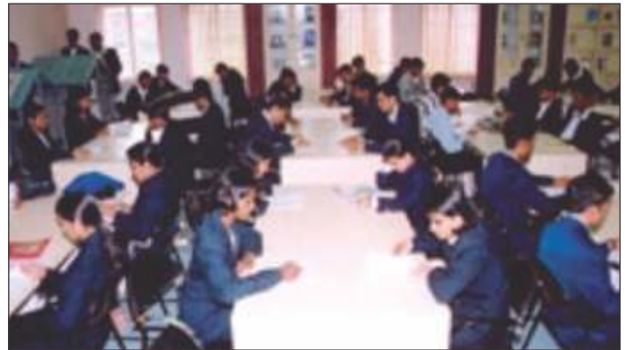
Students in Library and Reading room