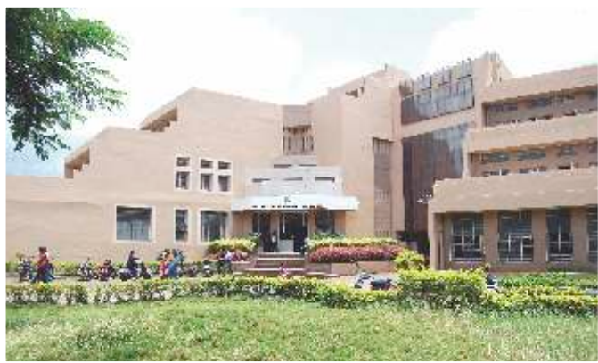
Institute of Management, Kolhapur