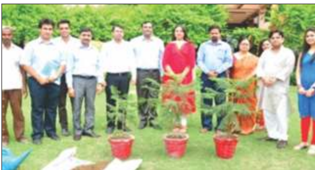
International Ozone Day