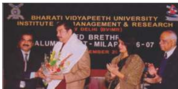
Hon'ble Shatrughan Sinha during an event.

The faculty members of the Institute are dedicated professionals with academic excellence and rich industrial experience. They submit themselves to a rigorous, open and continuous process of appraisals and feedback from the students. This enables the faculty to fine tune their teaching skills. Independent committees, comprising of faculty/supporting staff/student body play a role in the governance of the institute and assume ownership of collective decision. Faculty members are active and regular participants in national, international conferences and symposium. They contribute to national/ international journals and collaborates with a broad range of agencies to develop and execute research/consultancy projects. Total No. of faculty : 48, Faculty with Ph. D :14, Faculty pursuing Ph. D :26, Faculty with Ind. exp.27, visiting faculty : 36