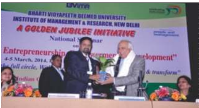
Ex Union HRD Minister Shri. Kapil Sibal at BVIMR