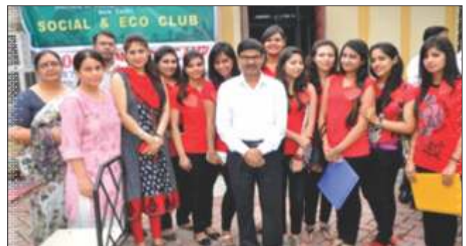
Blood donation camp by Eco Club