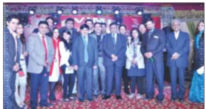
A glimpse into the Annual Alumni Meet