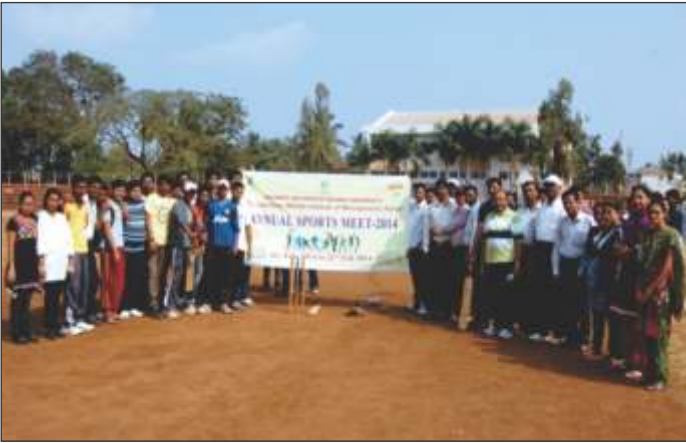
Inauguration of Annual Sports Week