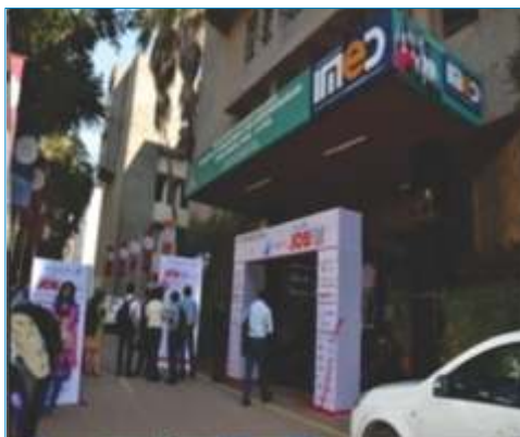
Job Fair at IMED

A national seminar on "Cyber Crimes and Cyber Security" was organized on 6th March 2014. This seminar aimed to sensitize the participants about the current potential threats posed due to cyber crimes and the strategies for combating the same.